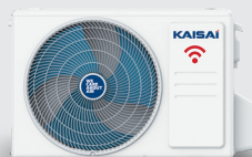
Outdoor unit KWX